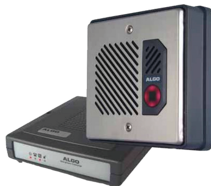
Door Station Faceplate Options

* Requires the Algo 8061 IP Relay Controller, sold separately