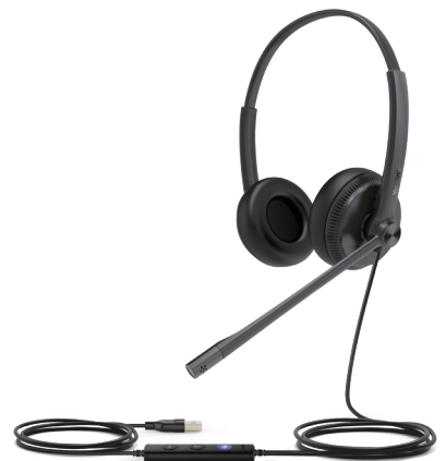
UH34/UH34 Lite Dual Teams UH34/UH34 Lite Dual UC