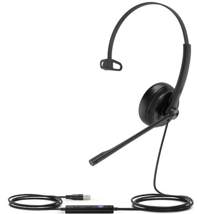
UH34/UH34 Lite Mono Teams UH34/UH34 Lite Mono UC

The hand-held controller with LED indicator provides easier access to key call control capabilities, including answer call, end call, reject call, and mute/unmute.