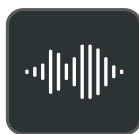
Optima Audio Experience