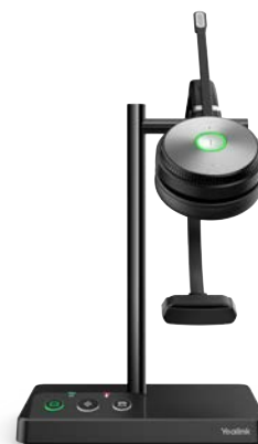
WH62 Mono Teams WH62 Mono UC