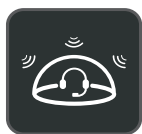
Acoustic Shield Technology

The Yealink WH62 is a new entry-level DECT wireless headset, with WH62 Dual and WH62 Mono two models. Work seamlessly with major UC platforms and integrate natively with Yealink IP phones. Yealink Full-band Audio Technology and Acoustic Shield Technology make you talk and hear clearly during phone calls and enjoy the stereo crystal music experience. With easily on-ear control, interruption free, comfortable wearing, WH62 is a nice partner either for communicating or collaborating.