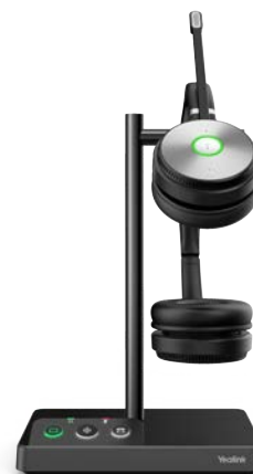
WH62 Dual Teams WH62 Dual UC

Based on hundreds of headform evaluations and thousands of wearing comfort tests, WH62 well meets the ergonomic requirements. Besides, with premier soft leather cushions and lightweight design, you can wear it all day comfortably. For more workspace freedom, WH62 can also free you up to 160m away from the desk.