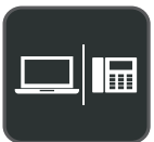
Multiple Devices Connection