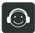
All Day Wearing Comfort